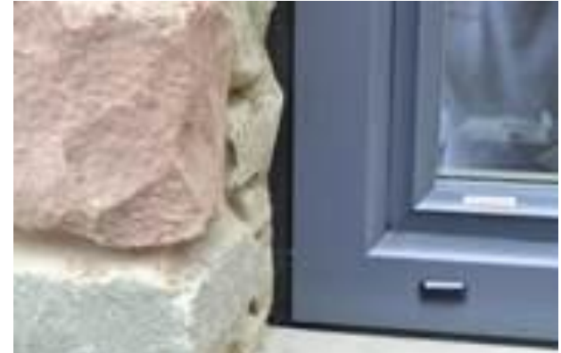
All you see is a shadow around the frame after the foam has expanded, with the foam following the contours of the brickwork perfectly and with no silicon lines leaving you a waterproof and sound proof finish, guaranteed UV stable for ten years with a life expectancy 25 years+ Where silicone would eventually lose the seal over time, win2wall creates a total seal every time.